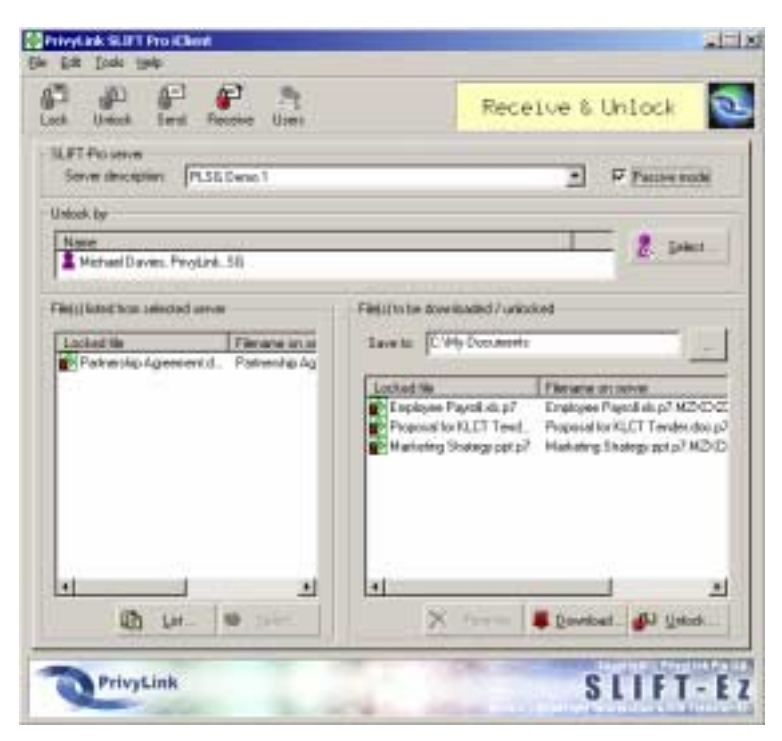
Figure 1.1 – SLIFT Pro Client Interactive (SLIFT Pro-I) Main GUI

The SLIFT Pro Client has the capabilities to schedule file transfer jobs with the user friendly AT client, at the same time supporting manual file transfer using the SLIFT Pro iClient. By making use of the TrustField Platform, the SLIFT Pro clients also encompasses sender and recipient keys/certificates, and some verification modules that greatly facilitate secure file exchange between multiple parties (Files are exchange using FTP-SSL).